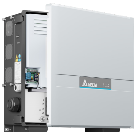
Front door for easy access to internal components

Convenient commissioning using a smartphone via Bluetooth interface. System monitoring using a smartphone app or MyDeltaSolar Cloud.