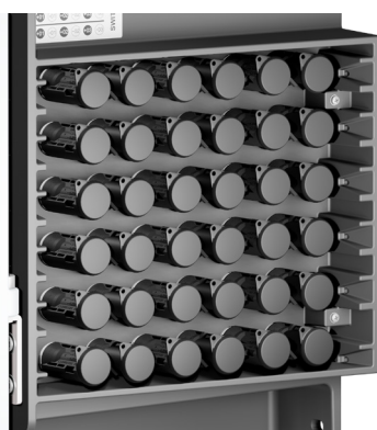
M70A: 6 MPP trackers for 3 module strings each