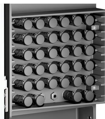
M100A: 8 MPP trackers for 2 module strings each