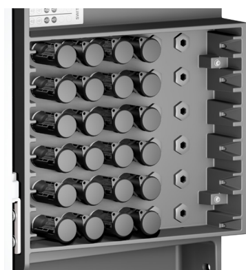
M50A: 6 MPP trackers for 2 module strings each